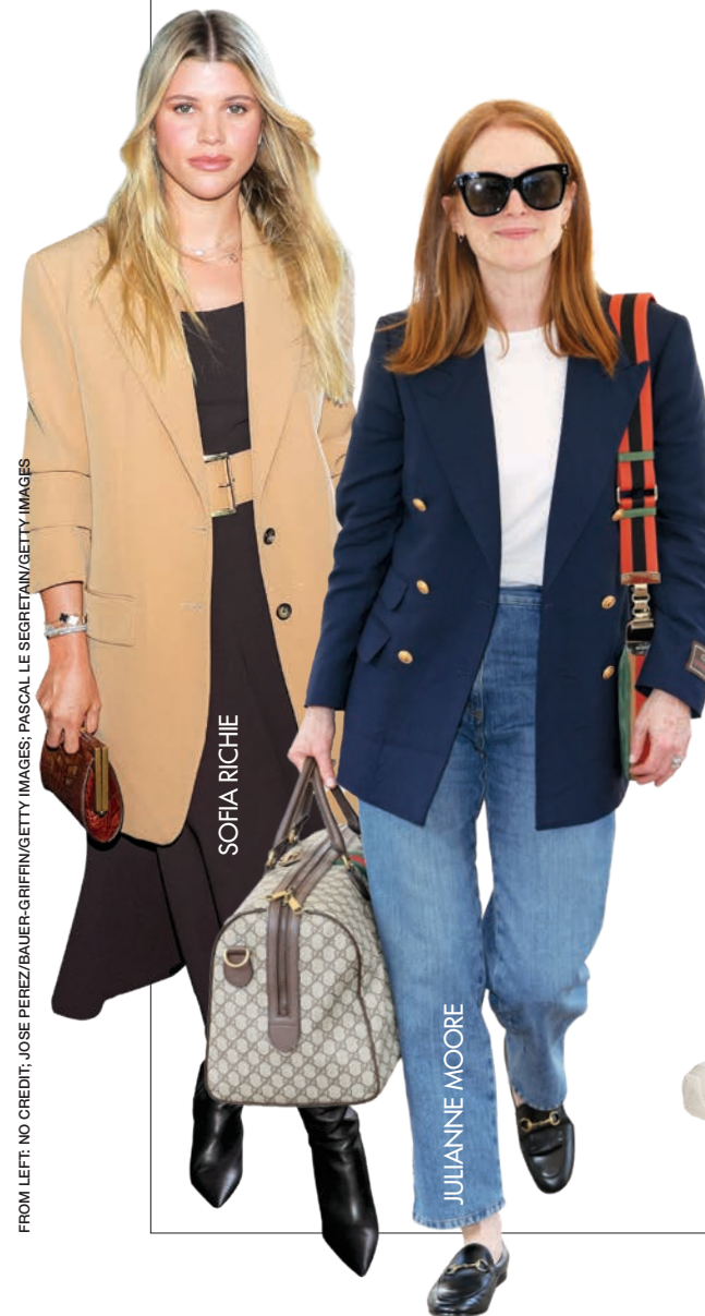
FROM LEFT