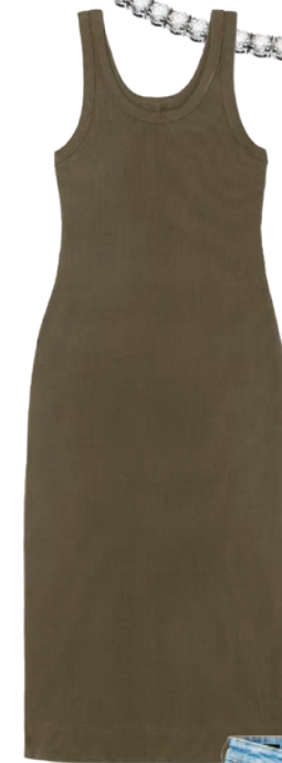
A MIDI TANK DRESS "I have a couple of tank dresses. To be casual, I tie a knot at the side to make the dress shorter and add white runners and a denim jacket. I can also let it down, add a blazer and wraparound strappy sandals and I'm ready to go out." The Ribbed Tank Dress in Beech , $121, everlane.com