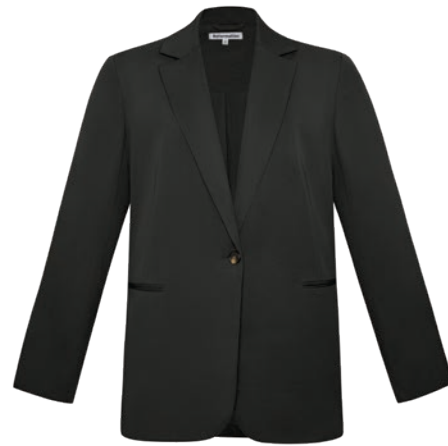
AN UNSTRUCTURED BLAZER "Everyone needs a blazer. The most classic style is unstructured and straight cut – not double breasted – with an average-sized lapel." The Classic Relaxed Blazer in Black , $398, thereformation.com