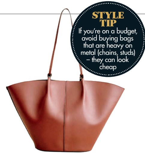
A SIMPLE TOTE BAG "A tote never goes out of style. If you're casual, you could go for canvas. If you're bougie and want to spend more money, you might buy a Goyard or Louis Vuitton tote." Mara Bag in Smooth Chocolate , $630, sezane.com