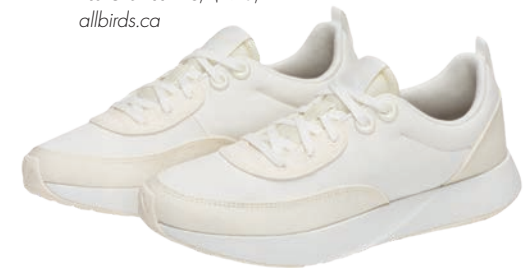
A WHITE SNEAKER "You can wear white sneakers with a dress or with athletic wear. You can also dress them up with a blazer, a collared shirt and a tailored jean." Women's Couriers Shoes in Natural White , $170, allbirds.ca

STYLE TIP Toss your white sneakers in the washing machine with a towel to keep noise to a minimum and they'll come out looking good as new!