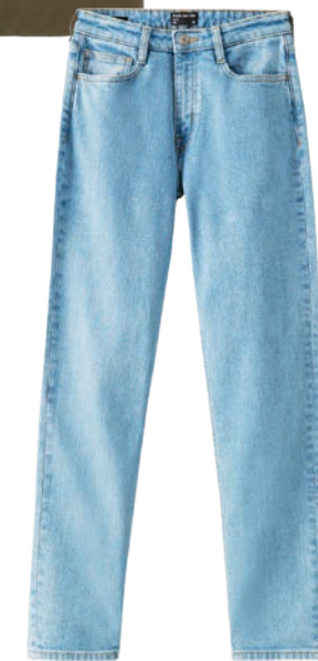
A STRAIGHT-LEG JEAN "Jeans are a wardrobe staple and I like a straight leg – not too wide or too skinny – in some modification that works for your body." The Cyndi High Rise Straight Jean in Light Indigo , $119, ca.frankandook.com